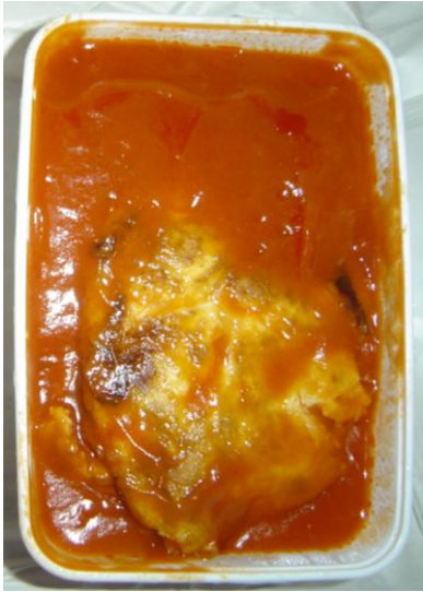
foe yong hai