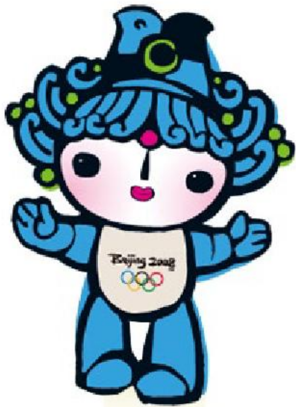
bei - bei